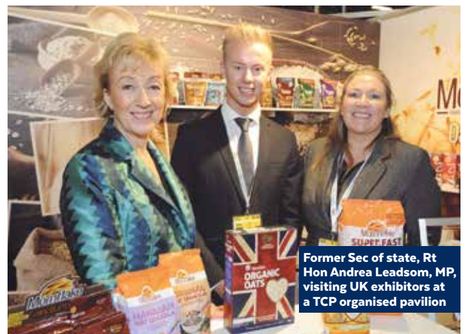
Former Sec of state, Rt Hon Andrea Leadsom, MP, visiting UK exhibitors at a TCP organised pavilion