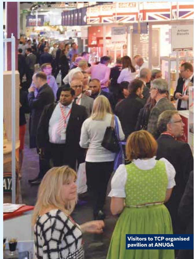
Visitors to TCP organised pavilion at ANUGA

Involvement of TCPs to act as expert advisors, where appropriate, within industry sectors