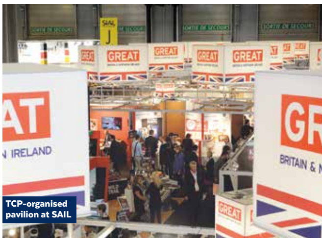
TCP-organised pavilion at SAIL